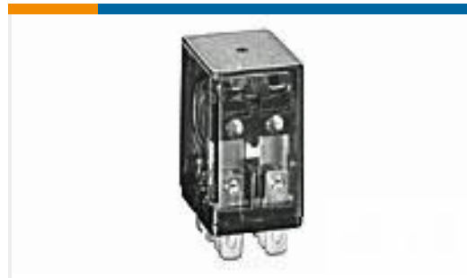
TE Part #5-1393144-4 K10P-11D15-110=K10/K20