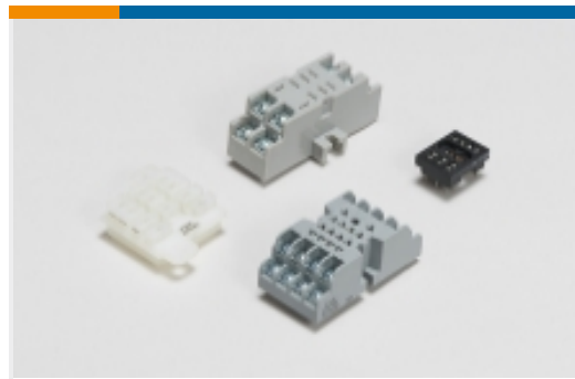
Relay Accessories, Sockets & Clips(3)