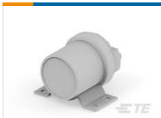
TE Part #K1021595 Relay 26-71-04