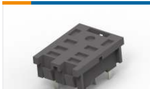
TE Part #2-1419106-1 27E489=SOCKET,K10,8,QC.187,NYL