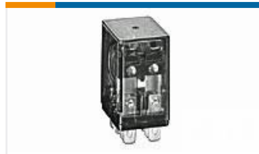
TE Part #5-1393144-9 K10P-11D15-48=K10/K20