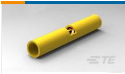
TE Part #2-323994-1 PIDG BUTT SPLC WDW 26-22; TAPE