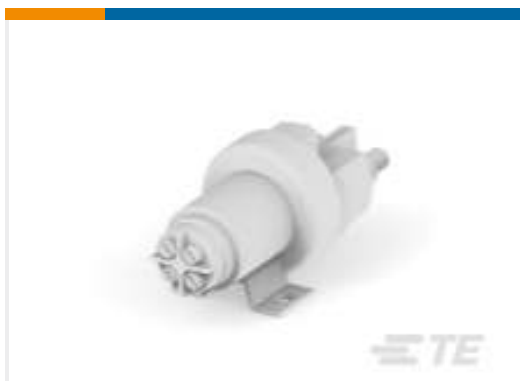
TE Part #K1060542 Relay 26-55-710