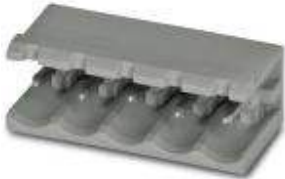
The figure shows a 5-pos. version of the product in gray

Header, Nominal current: 12 A, Rated voltage (III/2): 320 V, Number of positions: 15, Pitch: 5 mm, Color: black, Contact surface: Tin, Mounting: Wave soldering