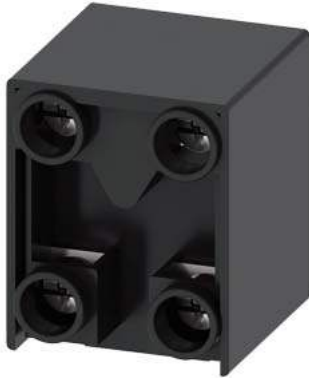
Contact block IP20 for position switch 3SE5250 open type design 1 NO/1 NC quick action contact