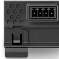
RS485 interface - Black