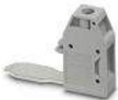
Pick-off terminal block, Connection method: Screw connection, Cross section: 0.5 mm 2 - 10 mm 2 , AWG: 20 - 8, Width: 10.2 mm, Height: 34.7 mm, Color: gray, Mounting type: On base element

Pick-off terminal block - AGK 10-UKH 150/240 - 3003554