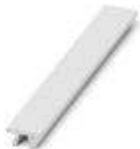
Zack marker strip, Strip, white, unlabeled, can be labeled with: Plotter, Mounting type: Snap into tall marker groove, for terminal block width: 22 mm, Lettering field: 10.5 x 21.8 mm

Zack marker strip - ZB 22:UNBEDRUCKT - 0811862