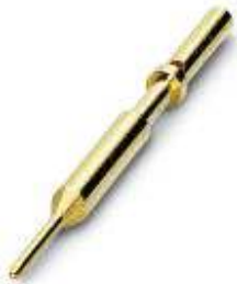
Crimp contact, turned, Contact diameter: 0.6 mm, Crimp range: 0.34 mm 2 ...0.5 mm 2

Please be informed that the data shown in this PDF Document is generated from our Online Catalog. Please find the complete data in the user's documentation. Our General Terms of Use for Downloads are valid ( http://download.phoenixcontact.com )