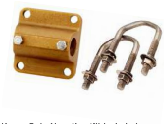
Heavy-Duty Mounting Kit Included