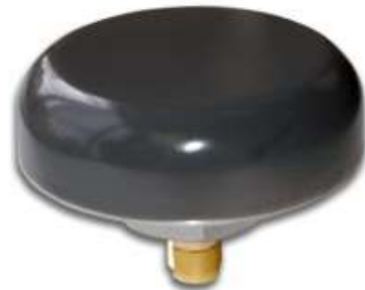
TW3600 Dimensions (mm)

The TW3600 is housed in a permanent mount industrial-grade weather-proof enclosure and comes with a TNC Jack (female) connector, allowing for the Iridium™ modem to be mounted out of the elements and reach, and still providing excellent Iridium™ signal coverage.