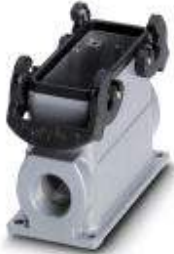
The figure shows the article as type B 24

HEAVYCON box mounting base B16, with double locking latch, height 84 mm, with support 1xM25