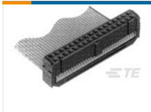
TE Part #1-1658622-0 50 NOVO MIL/CTR 30DP, LEAD FREE