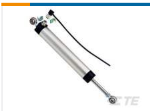
TE Part #04-1270-0014 CLWG-300-SC4