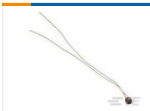
TE Part #SP44905X-16 44905X GSFC 311P18-05A7R6