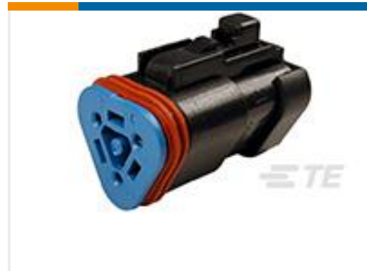
TE Part #DT06-3S-EP10 PLG, 3P, BLK, 120 OHM RESISTOR