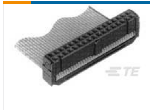
TE Part #1658622-8 34 NOVO MIL/CTR 30DP, LEAD FREE