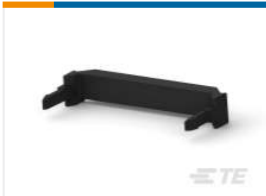
TE Part #499252-4 Bus Connector: Strain Relief, ATA