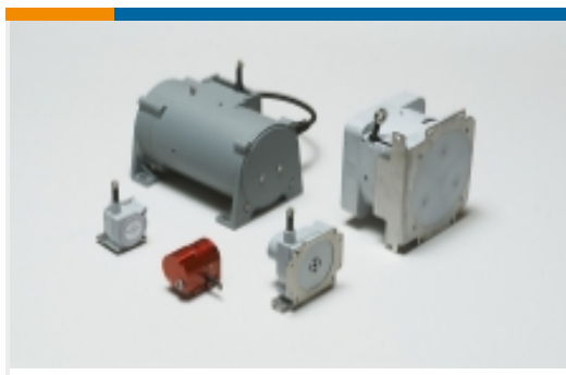
Cable Actuated Position Sensors(12)