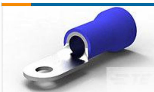
TE Part #52265-3 TERMINAL R PG 6 10