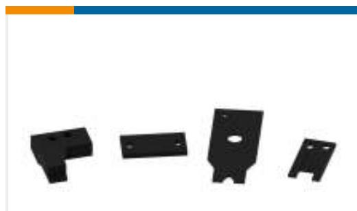
TE Part #2-690482-9 PLATE, FRONT SHEAR