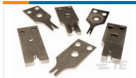
TE Part #4-456134-6 CRIMPER, INSULATION "F" (.180")