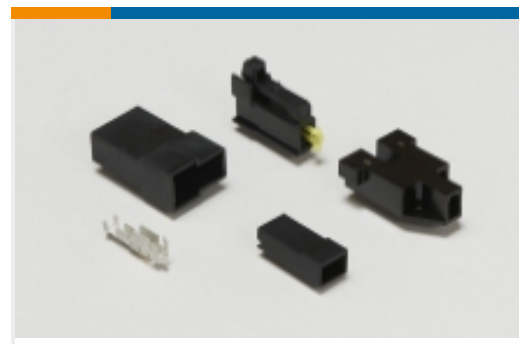
Magnet Wire Terminals(1)