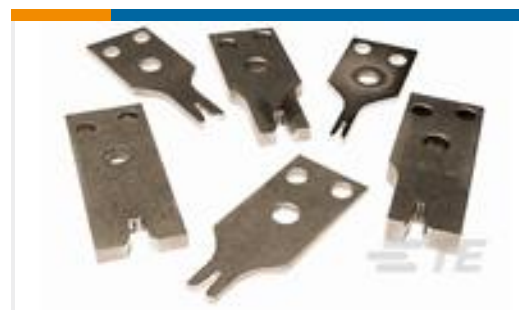
TE Part #7-568176-6 CRIMPER, WIRE