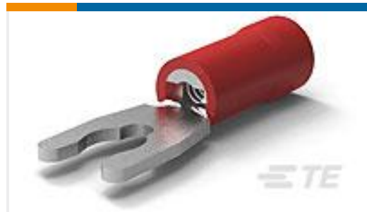
TE Part #52949-3 PG SPR SPD 22-16COMM 22-18MIL6