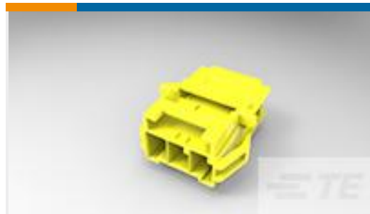
TE Part #4-1971772-3 PTL 1X3 CAP PANEL MT STD TEMP KEY D YEL