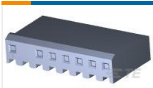
TE Part #794115-8 08P SL156 HSG W/LR,W/O#2