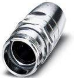
Sleeve housing for coupler connector, straight, Screw locking, M23, Shielded: No, Cable cross section: 3 mm...10 mm

Please be informed that the data shown in this PDF Document is generated from our Online Catalog. Please find the complete data in the user's documentation. Our General Terms of Use for Downloads are valid ( http://download.phoenixcontact.com )