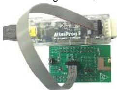
Fig 3: Programming/Debugging with MiniProg3

Connect the MiniProg3 to the J4 10-pin header