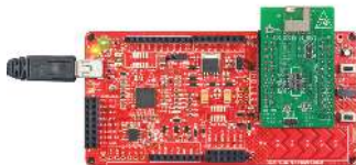
Fig 4: Programming and debugging with CY8CKIT-042-BLE BLE Pioneer Kit Baseboard

Note: Jumper on CYBLE-222005-EVAL's J3 header can be connected or disconnected.