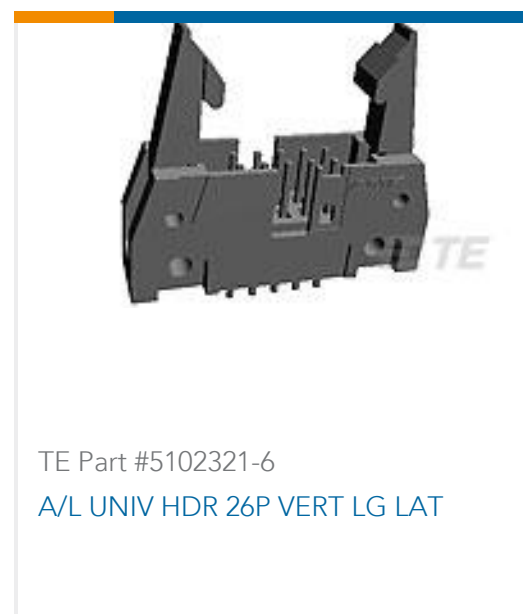
TE Part #5102321-6 A/L UNIV HDR 26P VERT LG LAT