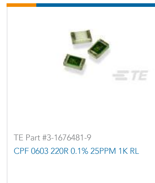
TE Part #3-1676481-9 CPF 0603 220R 0.1% 25PPM 1K RL