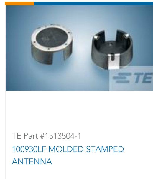
TE Part #1513504-1 100930LF MOLDED STAMPED ANTENNA