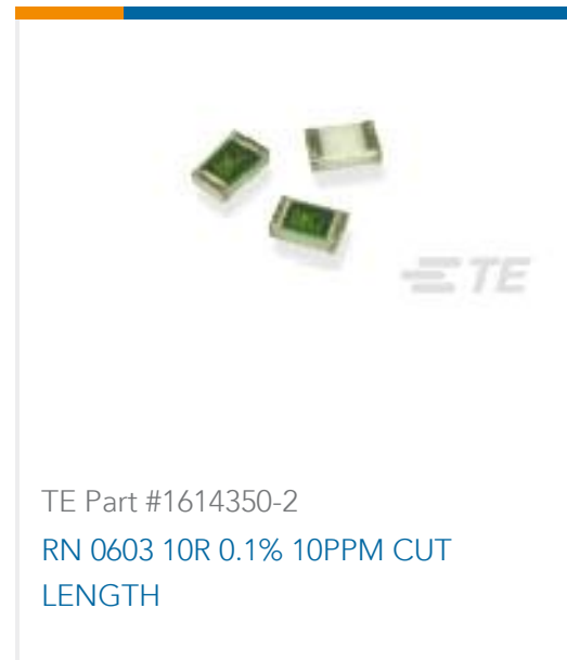
TE Part #1614350-2 RN 0603 10R 0.1% 10PPM CUT LENGTH