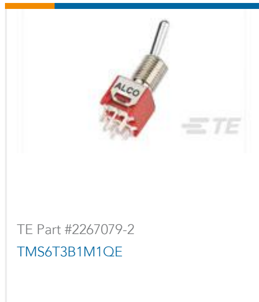
TE Part #2267079-2 TMS6T3B1M1QE