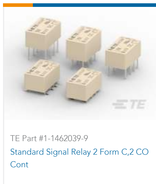
TE Part #1-1462039-9 Standard Signal Relay 2 Form C, 2 CO Cont