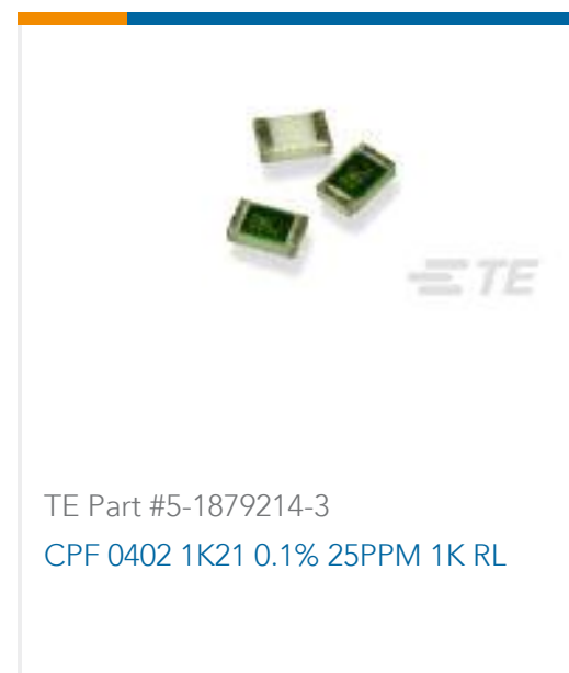
TE Part #5-1879214-3 CPF 0402 1K21 0.1% 25PPM 1K RL