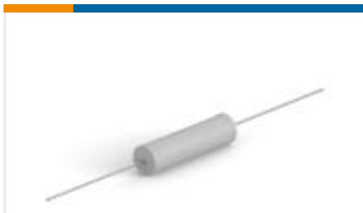
TE Part #4-2176414-8 7W STD M/OX 5% 1K8