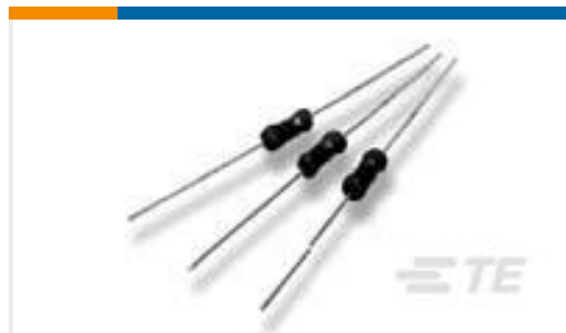
TE Part #4-1879350-2 RR01 5% 11R AMMO