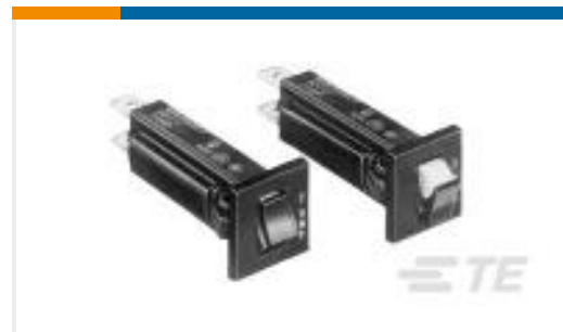
TE Part #1-1393250-7 W28-XQAT-15=W28