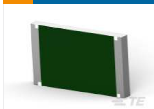
TE Part #8-2176407-8 3560 27R 5%