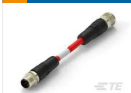
TE Part #TAA545B1411-060 M12A4-MS-FS-PVC-6.0M