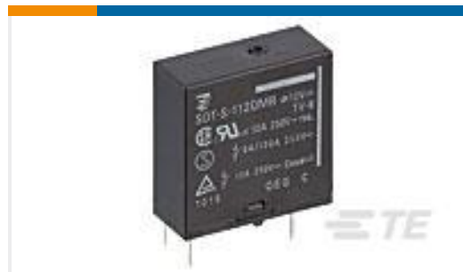
TE Part #8-1419125-5 SDT-S-106LMR,000