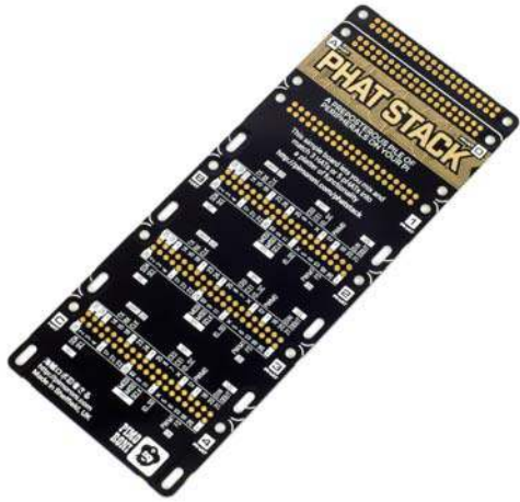
PCB Only /PIM320