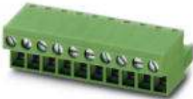
The figure shows a 10-position version of the product

Plug component, Nominal current: 12 A, Rated voltage (III/2): 320 V, Number of positions: 11, Pitch: 5 mm, Connection method: Screw connection, Color: green, Contact surface: Tin