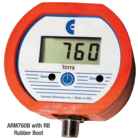
ARM760B with RB Rubber Boot