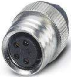
Sensor/actuator flush-type socket, 4-pos., M8, with straight solder connection

Please be informed that the data shown in this PDF Document is generated from our Online Catalog. Please find the complete data in the user's documentation. Our General Terms of Use for Downloads are valid ( http://download.phoenixcontact.com )