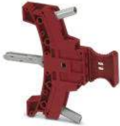
Test plug, Number of positions: 1, Width: 9 mm, Color: red

Please be informed that the data shown in this PDF Document is generated from our Online Catalog. Please find the complete data in the user's documentation. Our General Terms of Use for Downloads are valid ( http://phoenixcontact.com/download )