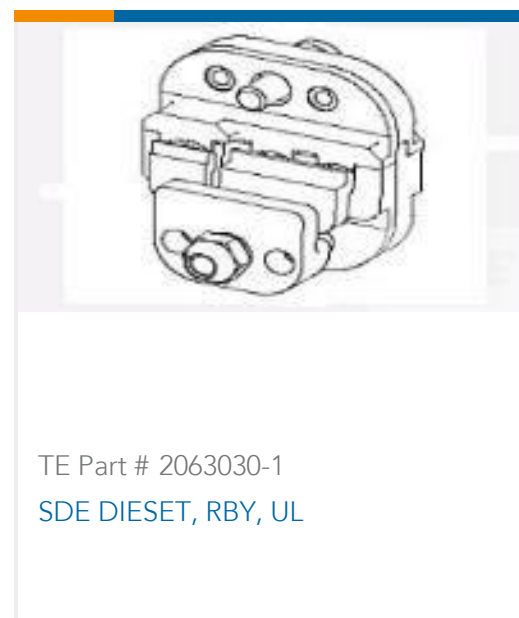
TE Part # 2063030-1 SDE DIESET, RBY, UL