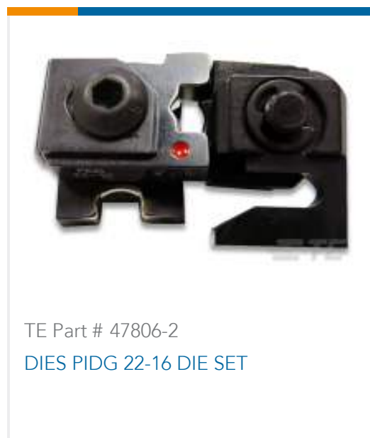
TE Part # 47806-2 DIES PIDG 22-16 DIE SET