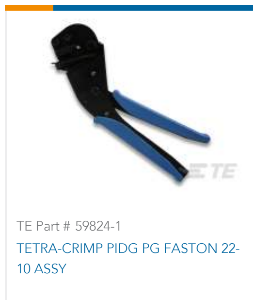
TE Part # 59824-1 TETRA-CRIMP PIDG PG FASTON 22-10 ASSY