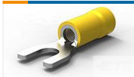
TE Part #34176 TERMINAL,PG SPD 12-10 10