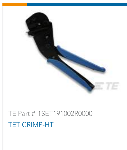
TE Part # 1SET191002R0000 TET CRIMP-HT