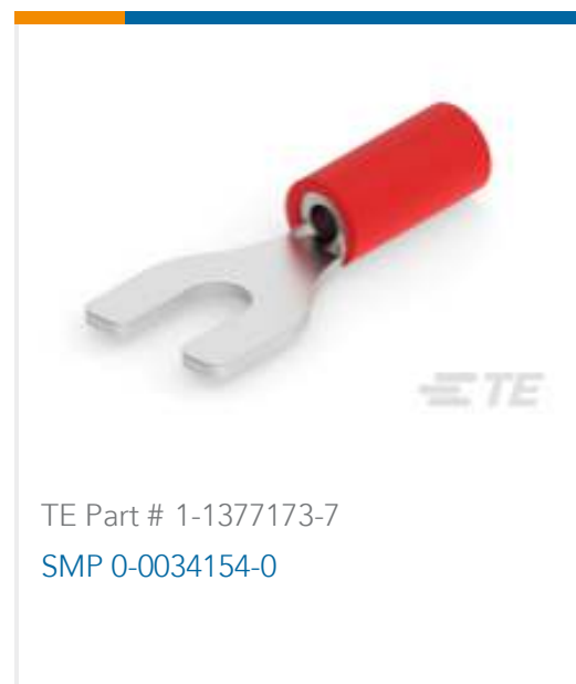
TE Part # 1-1377173-7 SMP 0-0034154-0