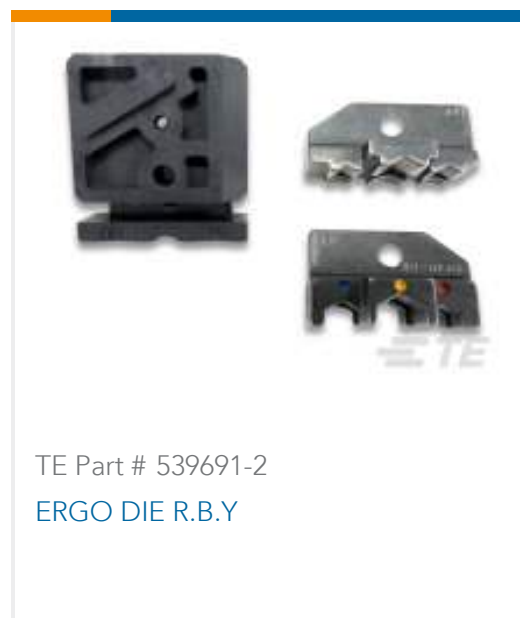
TE Part # 539691-2 ERGO DIE R.B.Y