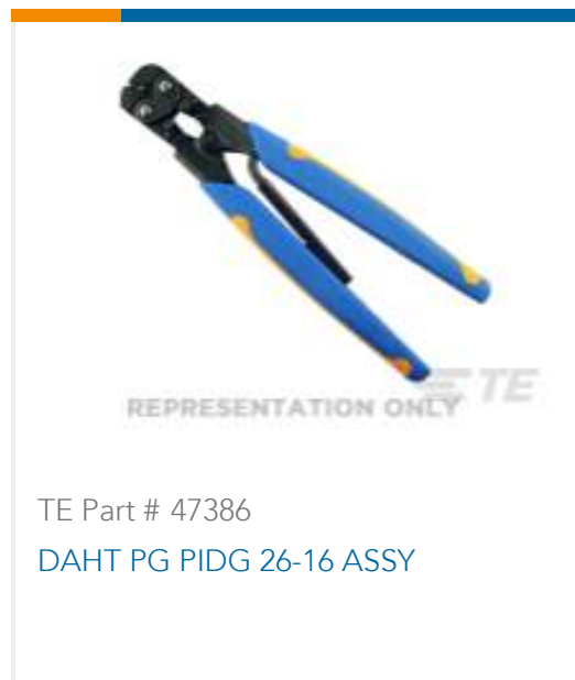
TE Part # 47386 DAHT PG PIDG 26-16 ASSY