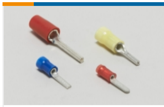
Crimp Wire Pins, Tabs & Ferrules(25)