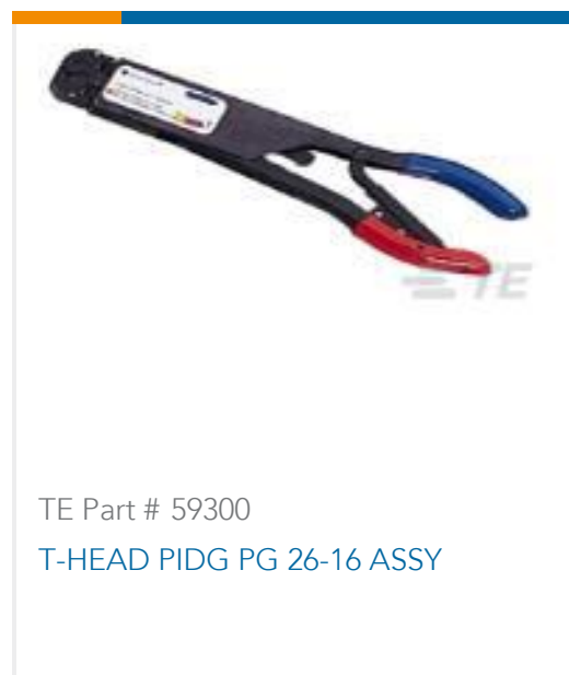
TE Part # 59300 T-HEAD PIDG PG 26-16 ASSY