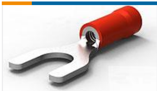
TE Part #34156 PG SPD 22-16 COMM 22-18 MIL 10