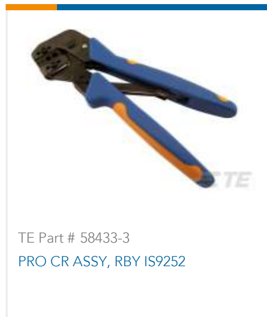
TE Part # 58433-3 PRO CR ASSY, RBY IS9252