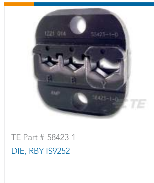
TE Part # 58423-1 DIE, RBY IS9252