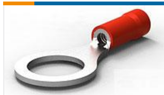
TE Part #34151 PG R 22-16 COMM 22-18 MIL 5/16