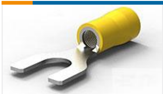
TE Part #165019 PG SPADE