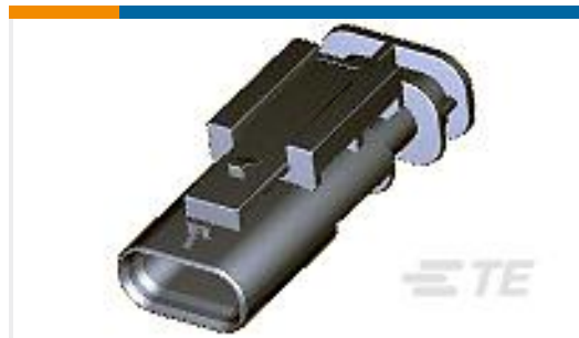
TE Part #2-1703494-1 3POS, MCON 1.2 LL TAB SEALED COD B