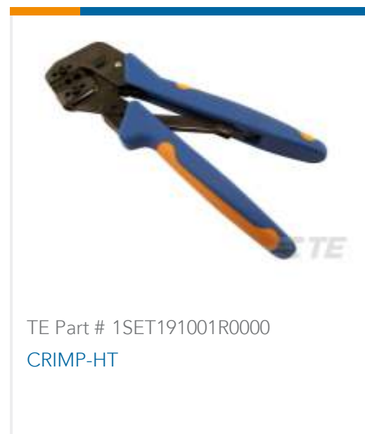
TE Part # 1SET191001R0000 CRIMP-HT