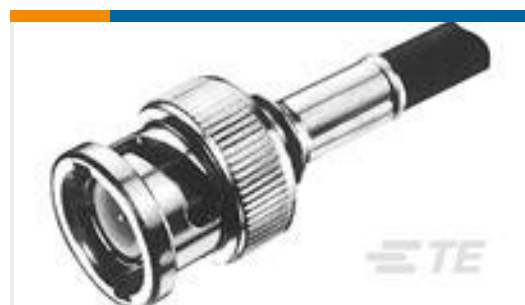
TE Part #1-5227079-1 COMM BNC PLUG