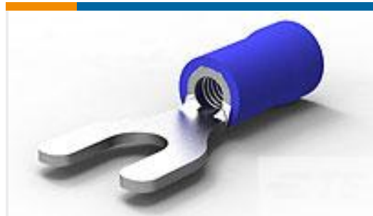
TE Part #34166 TERMINAL,PG SPD 16-14 8