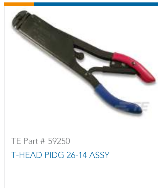
TE Part # 59250 T-HEAD PIDG 26-14 ASSY