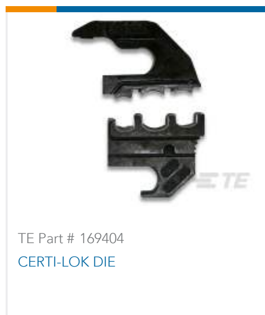
TE Part # 169404 CERTI-LOK DIE