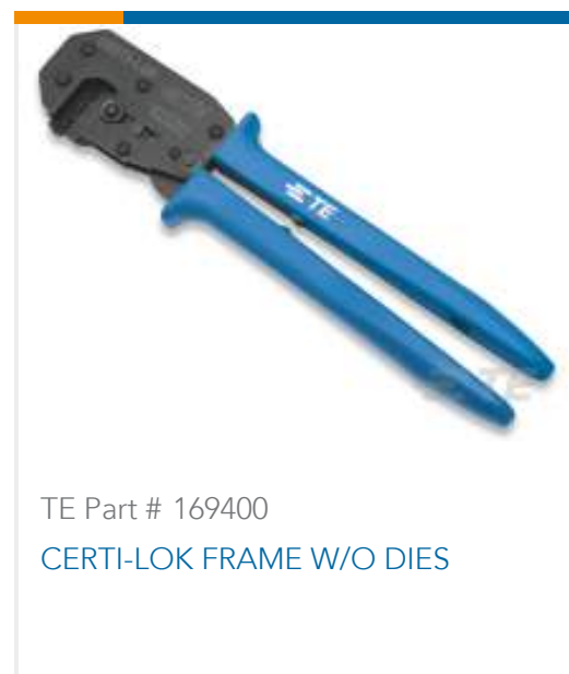
TE Part # 169400 CERTI-LOK FRAME W/O DIES