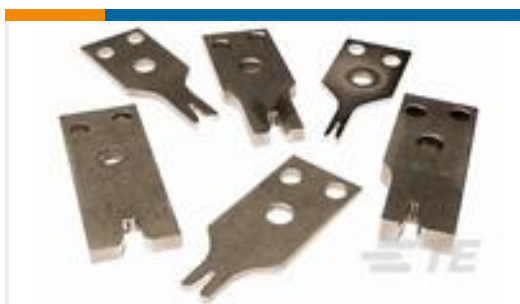
TE Part #2-456135-9 CRIMPER, INSULATION "O"(.210")