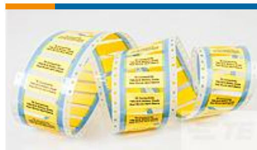
TE Part #617917-000 TMS-SCE-2X-1K-1/4-9