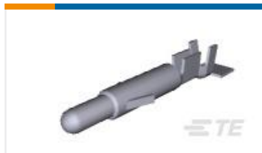
TE Part #350924-6 UMNL PIN 26-30 AUNI/PHBZ