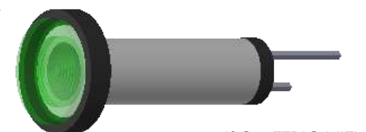
ISOMETRIC VIEW ONLY FOR REF.

The information in this document is the exclusive PROPRIETARY property of VISUAL COMMUNICATIONS COMPANY, LLC. It is disclosed with the understanding that acceptance or review by the recipient constitutes an undertaking by the recipient: (1) to hold this information in strict confidence (2) not to disclose, duplicate, copy, or use the information, in whole or in part, for any purpose other than that for which disclosed