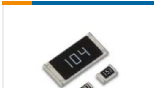
TE Part #4-2176349-4 CRGCQ 2512 39K 1%