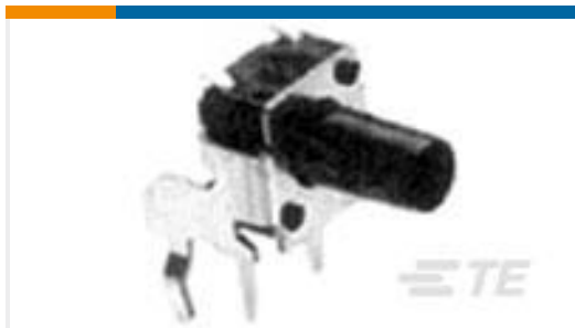
TE Part #1-1825027-1 FSMRA4JH04=R/A,TACT PB SW,160G