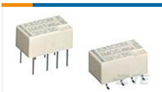
TE Part #1462037-1 IM01GR=IM RELAY 140mW 3V