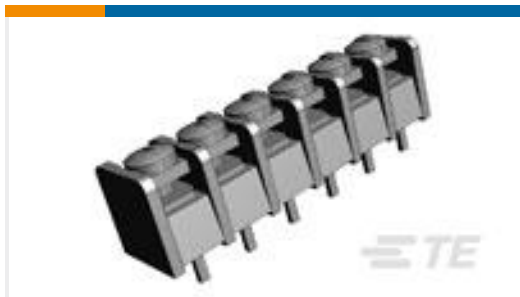
TE Part #2-1437667-9 4DB-P108-06=4DB ASSEMBLY