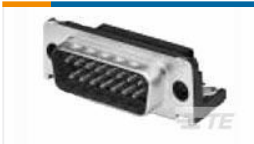
TE Part #5747842-2 25 MSFL PLUG RA 318 (FM,BL)