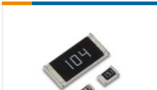
TE Part #2-2176343-8 CRGCQ 1206 1K8 1%