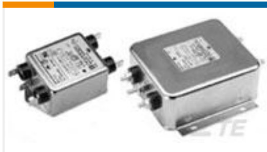
TE Part #6609043-2 6VV1=F7251 S0