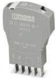
Electronic device circuit breaker, 1-pos., active current limitation, 1 N/O contact, plug for base element.

Please be informed that the data shown in this PDF Document is generated from our Online Catalog. Please find the complete data in the user's documentation. Our General Terms of Use for Downloads are valid ( http://download.phoenixcontact.com )