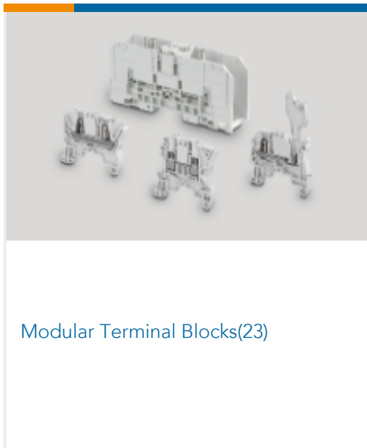
Modular Terminal Blocks(23)