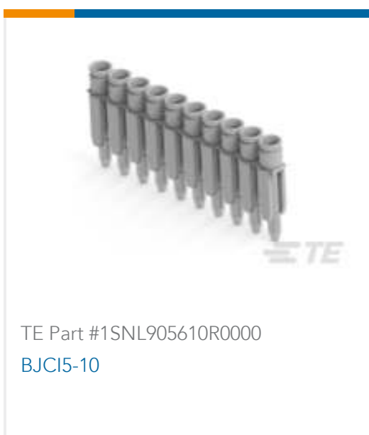
TE Part #1SNL905610R0000 BJC15-10