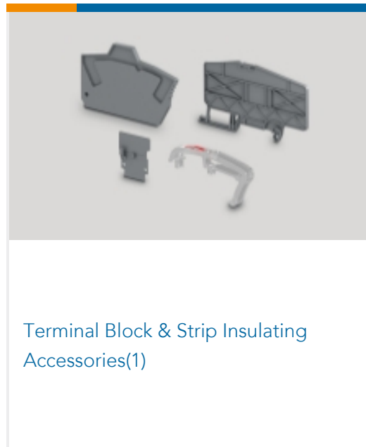
Terminal Block & Strip Insulating Accessories(1)