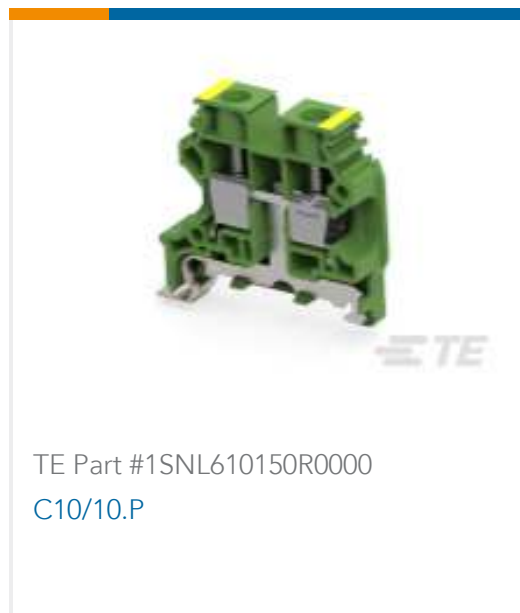
TE Part #1SNL610150R0000 C10/10.P