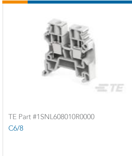
TE Part #1SNL608010R0000 C6/8