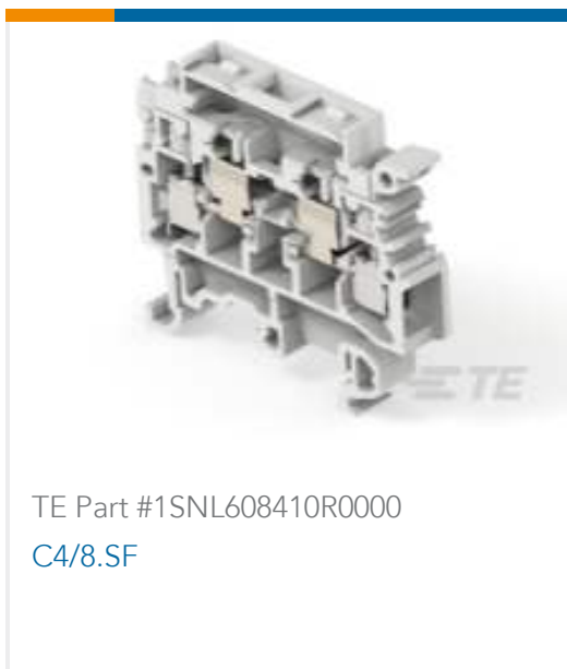
TE Part #1SNL608410R0000 C4/8.SF