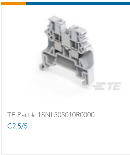
TE Part # 1SNL505010R0000 C2.5/5