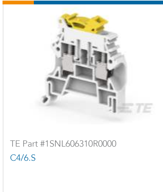
TE Part #1SNL606310R0000 C4/6.S