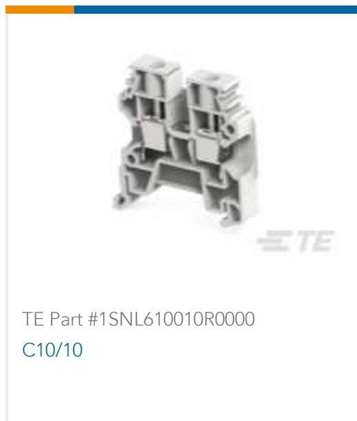
TE Part #1SNL610010R0000 C10/10