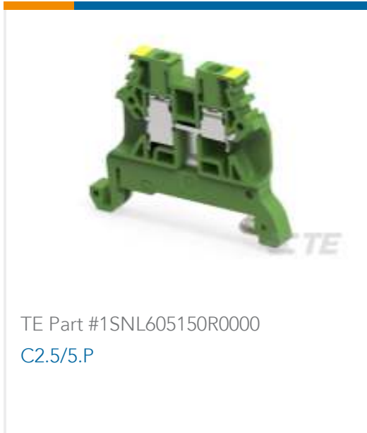
TE Part #1SNL605150R0000 C2.5/5.P