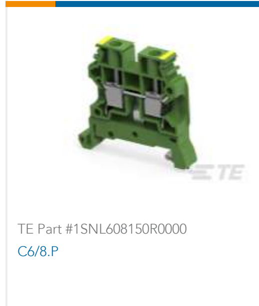
TE Part #1SNL608150R0000 C6/8.P