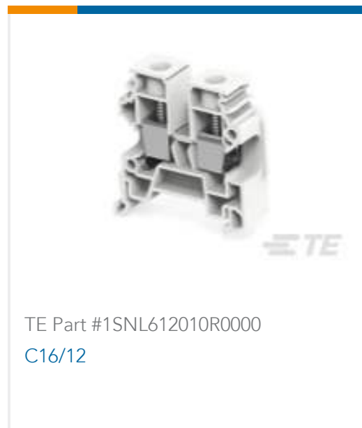
TE Part #1SNL612010R0000 C16/12