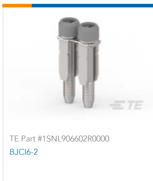
TE Part #1SNL906602R0000 BJC16-2