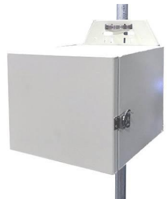
ENC-AL-12x14x15 Aluminum Enclosure