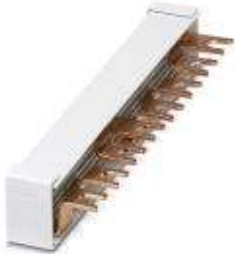
Wiring bridge for modules with connecting pitch 17.5 mm, 4-phase, 8-pos.

Please be informed that the data shown in this PDF Document is generated from our Online Catalog. Please find the complete data in the user's documentation. Our General Terms of Use for Downloads are valid ( http://phoenixcontact.com/download )