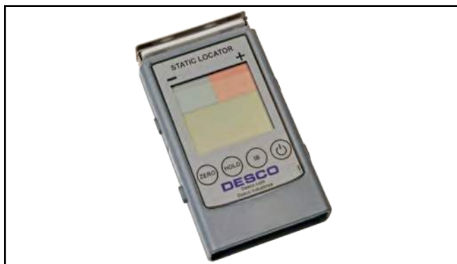
Figure 1. Digital Static Locator Item # 19430