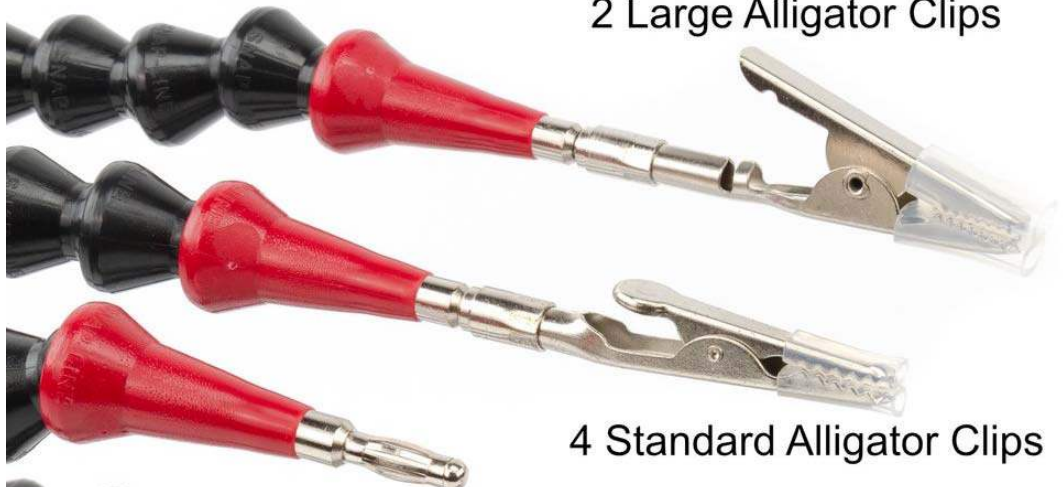
2 Large Alligator Clips