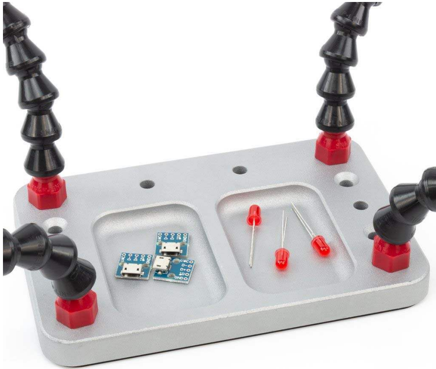
Built-in Parts Trays