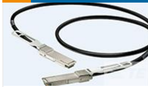
TE Part # 2829040-7 QSFP IB EDR, 26AWG, 2.0M