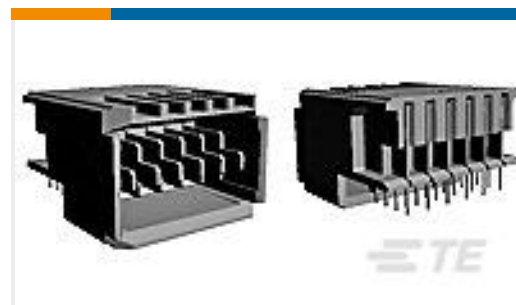
TE Part #120957-2 UPM EXPANDED PIN ASSEMBLY