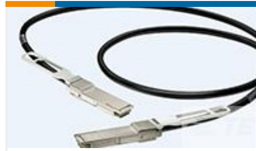
TE Part # 2829040-4 QSFP IB EDR, 30AWG, 1.0M