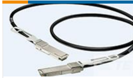
TE Part # 2829040-2 QSFP IB EDR, 33AWG, 1.0M