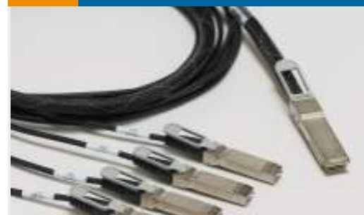
TE Part # 2821033-8 QSFP TO [4]SFP+, 28G, 1M, 33AWG