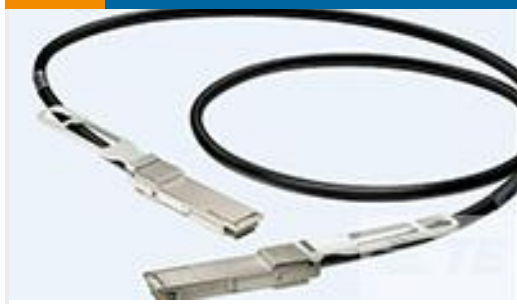
TE Part # 2829040-6 QSFP IB EDR, 30AWG, 2.0M