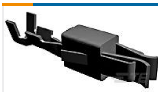
TE Part #927768-9 JPT REC 2.8 Contact SRC Au