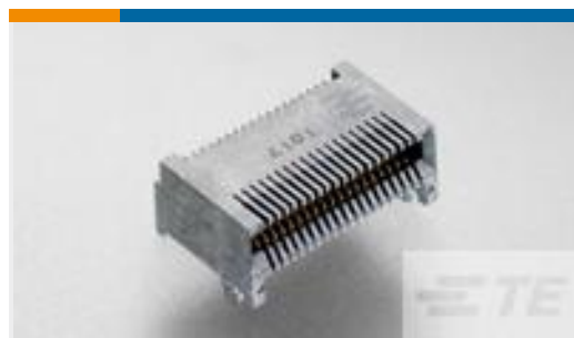
TE Part #2110819-1 QSFP+ Enh EVERCLEAR PT Conn