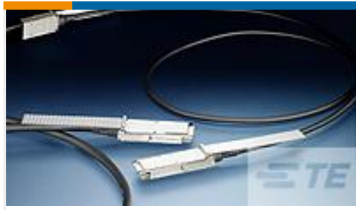
TE Part # 2202165-4 QSFP TO QSFP, 26AWG, FDR, 4.0 METER