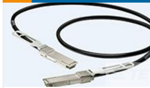
TE Part # 2829040-8 QSFP IB EDR, 26AWG, 3.0M