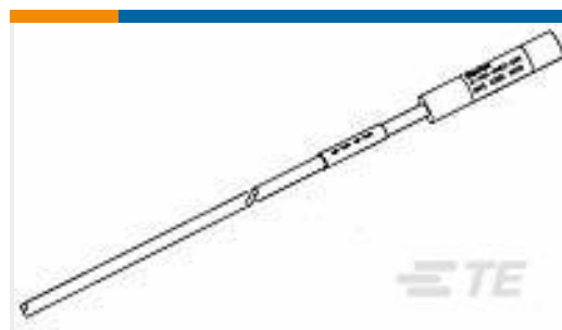
TE Part #CB1051-000 D-500-0463-J24-R120