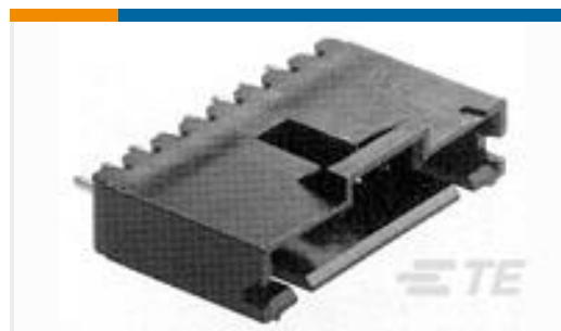
TE Part #104363-1 02 MTE HDR SRST LATCH .100CL