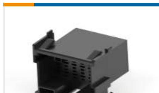
TE Part #967204-1 FLA-STE-GEH2,8 17P