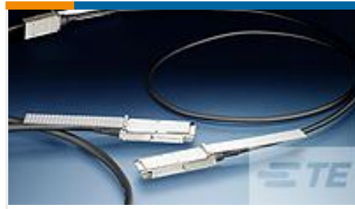
TE Part # 2202165-5 QSFP TO QSFP, 26AWG, FDR, 5.0 METER