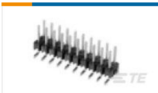
TE Part #5-146130-3 08 MODII HDR DRST SFMNT B/A LF