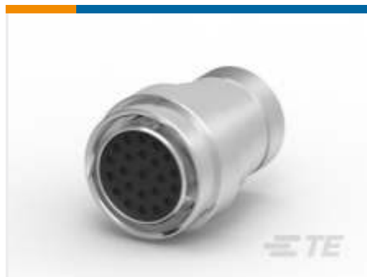
TE Part #HD36-24-23SN-072 PLG, 23P, AL, N, THD ADPT DRAIN, 16, S