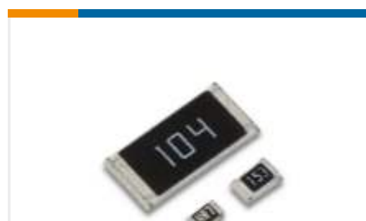
TE Part #2176347-2 CRGCQ 2010 12R 1%