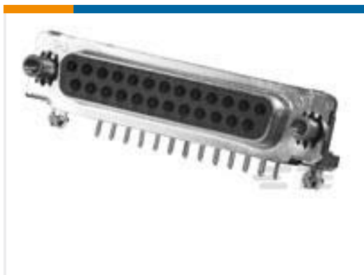
TE Part #5745781-3 09 MSFL RCPT RA 318 (IN,FM)