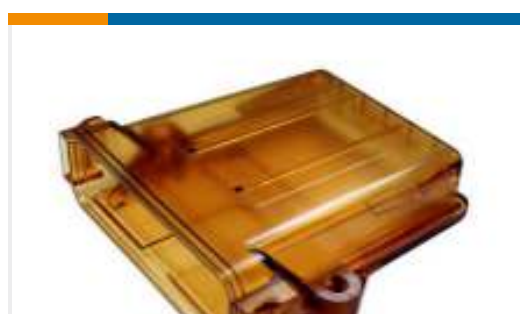
TE Part #EEC-325X4B-E016 ENCLOSURE, 3.25 X 4, CLR, NO VENT