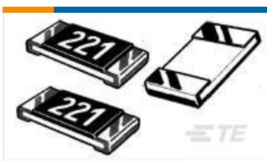
TE Part #5-2176070-4 3521 1K6 1% 2W