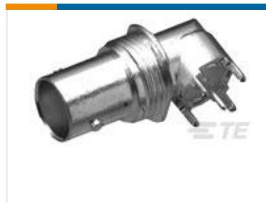
TE Part #5415025-1 JACK, RTANG, PCB, 50 OHM, BNC