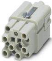
HEAVYCON socket insert, Q12 series, 12-pos., crimp connection, with coding option

Please be informed that the data shown in this PDF Document is generated from our Online Catalog. Please find the complete data in the user's documentation. Our General Terms of Use for Downloads are valid ( http://phoenixcontact.com/download )