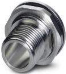
Housing screw connection, PlugLink:M12, Rear mounting, M15 x 1

Please be informed that the data shown in this PDF Document is generated from our Online Catalog. Please find the complete data in the user's documentation. Our General Terms of Use for Downloads are valid ( http://phoenixcontact.com/download )