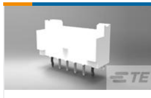
TE Part #1744439-6 EP2.5 Shrd HDR ASSY 6P VERT, GW