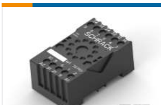
TE Part #8-1415034-1 MT78760