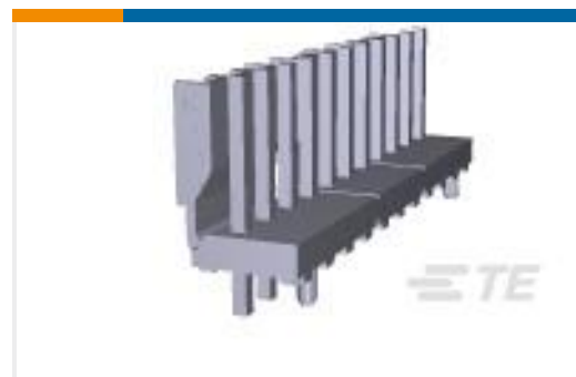
TE Part #4-644615-1 11P MTA156 POL HDR ASSY LF