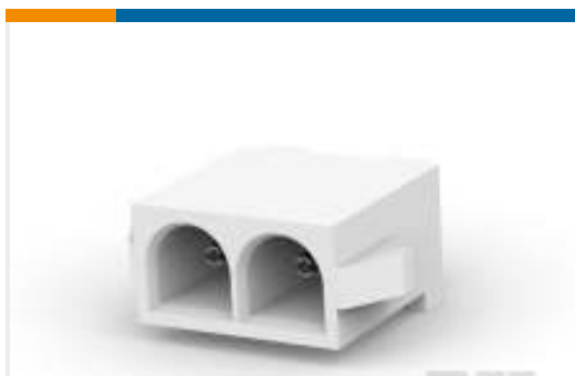
TE Part #1586076-1 02P UMNL PIN HDR W/O DRNS V2