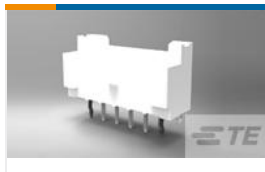
TE Part #1744439-4 EP2.5 Shrd HDR ASSY 4P VERT, GW