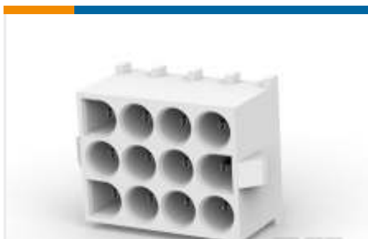
TE Part #1586176-1 12P UMNL PIN HDR 94VO NDH