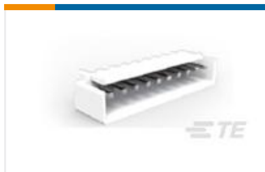
TE Part #1744427-5 EP Header Asy,Shrouded,5 Pos, GW