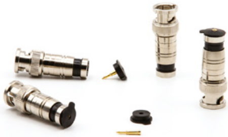
302-00CSTP Universal BNC Male Compression Seal