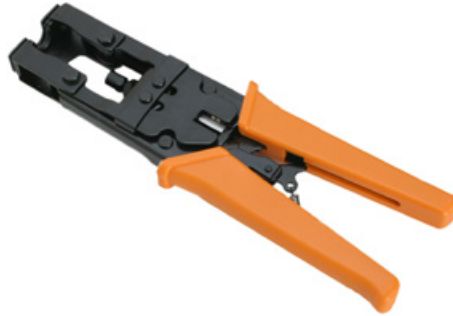
GET-CS11 Crimp Tool for High-Speed, Pass-Thru RJ45 Connectors