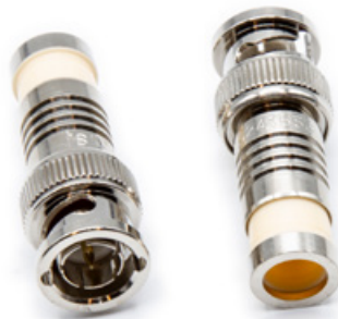
302-10CSTP BNC Male Compression Seal