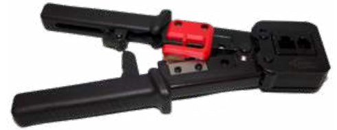
GET-HSCT CAT5/5e/6 High-Speed Crimper