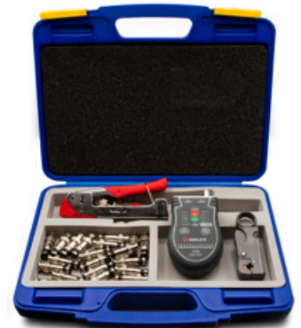
CS-TK00 Universal Compression Tool Kit