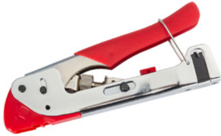
GET-CS00 Universal Crimp Tool for Crimp-On BNC Connectors