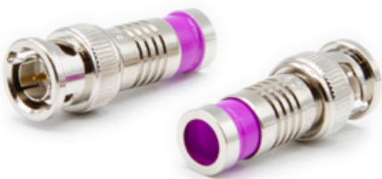
302-8241CSTP BNC Male Compression Seal