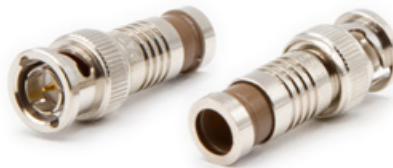
302-N2CSTP BNC Male Compression Seal