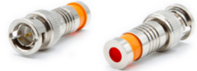
302-8240CSTP BNC Male Compression Seal