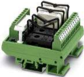
VARIOFACE module, for 4 plug-in miniature relays or miniature optocouplers, with LED, 230 V AC input voltage

Please be informed that the data shown in this PDF Document is generated from our Online Catalog. Please find the complete data in the user's documentation. Our General Terms of Use for Downloads are valid ( http://phoenixcontact.com/download )