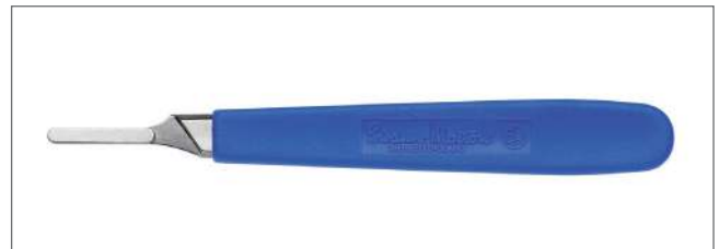
6A SM Handle only (acrylic handle) - Made in Great Britain