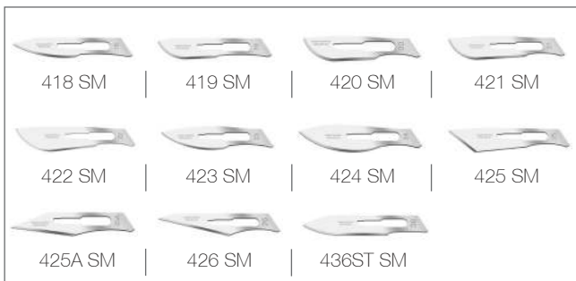
Larger fitment blades For handles 4, 6A SM - Made in Great Britain