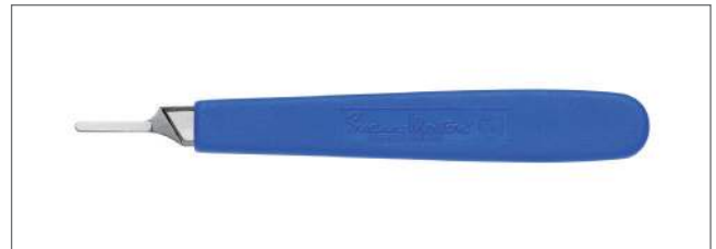
5A SM Handle only (acrylic handle) - Made in Great Britain