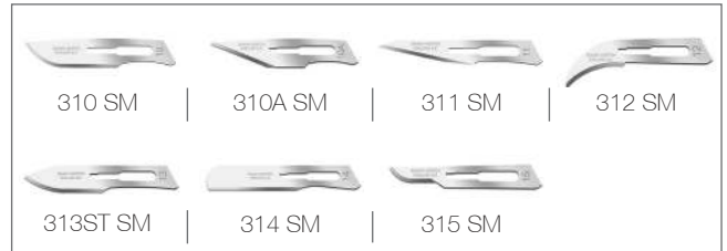
Small fitment blades For handles 3, 5A SM, 7 SM - Made in Great Britain

Handles no. 4 and 6A SM fit large fitment blades (418 SM, 419 SM, 420 SM, 421 SM, 422 SM, 423 SM, 424 SM, 425 SM, 425A SM, 426 SM, 436ST SM).