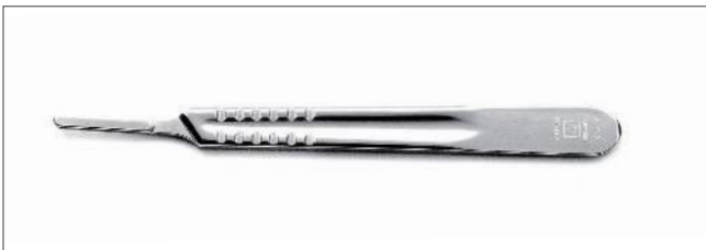
4 Handle only - Made in Germany

Handles no. 4 and 6A SM fit large fitment blades (418 SM, 419 SM, 420 SM, 421 SM, 422 SM, 423 SM, 424 SM, 425 SM, 425A SM, 426 SM, 436ST SM).