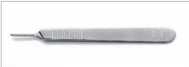
3 Handle only - Made in Germany

Handles no. 3 , 5A SM and 7 SM fit small fitment blades (310 SM, 310A SM, 311 SM, 312 SM, 313 SM, 314 SM, 315 SM).