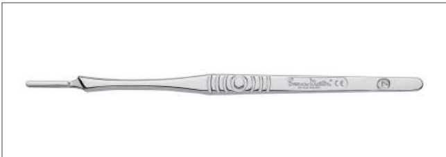
7 SM Handle only - Made in Great Britain