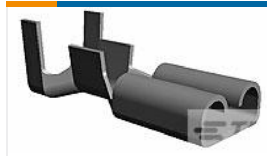
TE Part #60487-2 187 FASTON REC 18-16 AWG TPBR