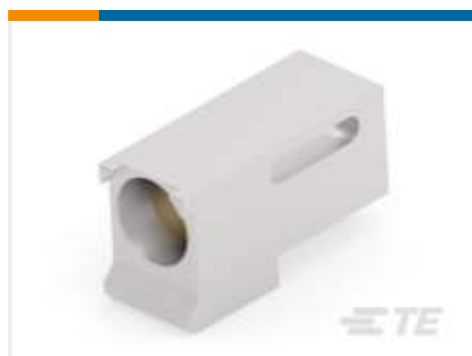
TE Part #1-2000713-0 RA Keyed Guide Mod, Vita 46, Machined