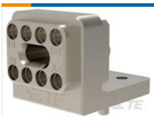
TE Part #2828431-1 NanoRF Daughtercard Module 8 POS SS