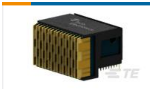
TE Part #2102771-1 DC, 7Row, Center, MULTIGIG RT 2R