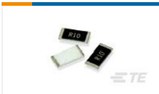
TE Part #2-2176055-4 RLP73N 2B R091 1% 1K RL