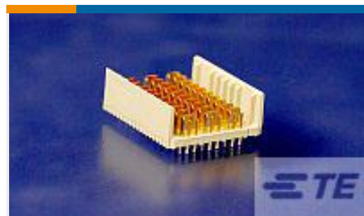
TE Part #6469083-1 HMZD 3PAIR, HDR ASSY, 25MM MOD