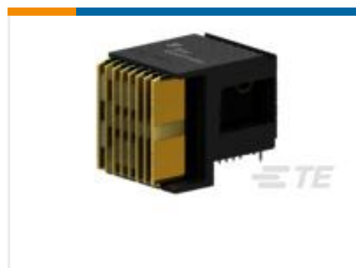
TE Part #2102772-1 DC, 7Row, Half Left End, MULTIGIG RT 2R