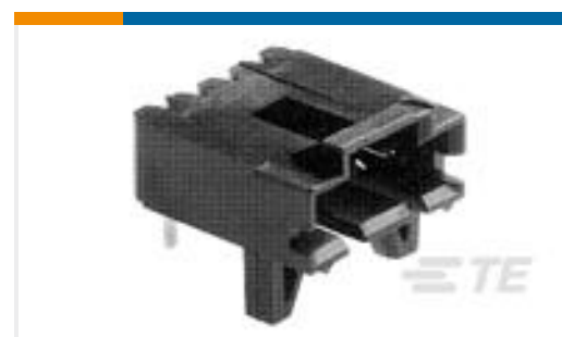
TE Part #5-103904-6 07 MTE HDR SRRA LATCH W/HLDWN