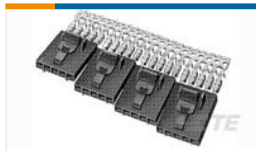
TE Part # 103961-1 10X2 MTE RCPT SR LATCH .100CL