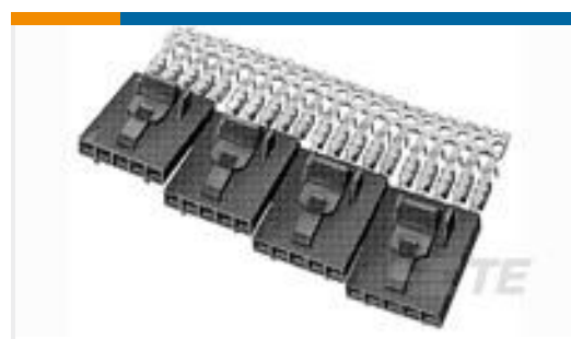
TE Part #5-103957-1 10X2 MTE RCPT SR LATCH .100CL