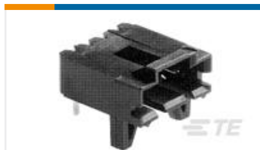
TE Part #5-103904-4 5 MTE HDR SRRA LATCH W/HLDWN