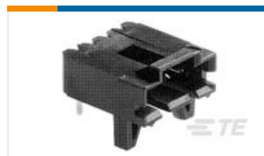
TE Part #5-103672-3 04 MTE HDR SRRA LATCH W/HLDWN