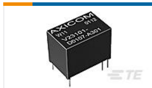
TE Part #2-1393779-6 V23101D 103A201