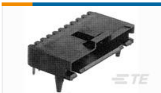
TE Part #5-104361-4 05 MTE HDR SRRA LATCH W/HLDWN