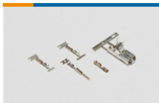
Wire-to-Board Connector Contacts(32)