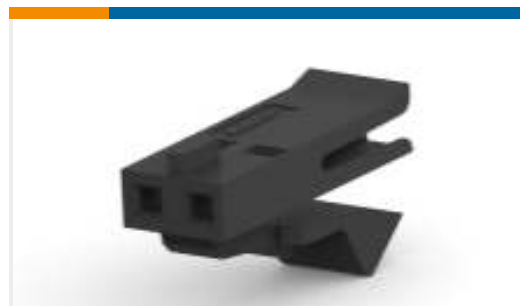
TE Part # 487526-1 002 HOUSING FFC RCPT 100CL SR