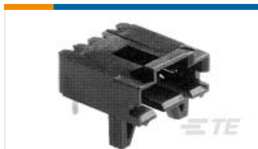
TE Part #5-103904-3 4 MTE HDR SRRA LATCH W/HLDWN