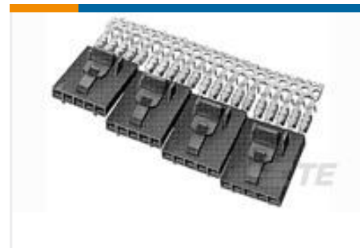
TE Part #5-103957-4 4X5 MTE RCPT SR LATCH .100CL