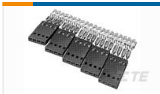
TE Part # 103970-1 10X2 MTE RCPT SR RIBBED .100CL