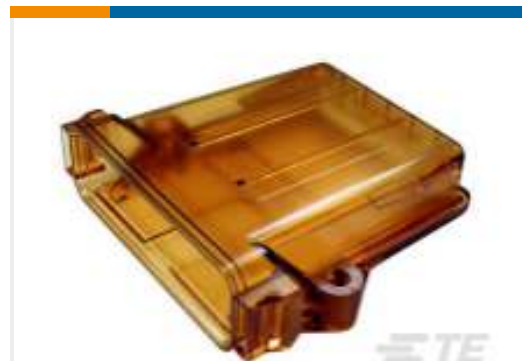
TE Part #EEC-325X4B-E016 ENCLOSURE, 3.25 X 4, CLR, NO VENT