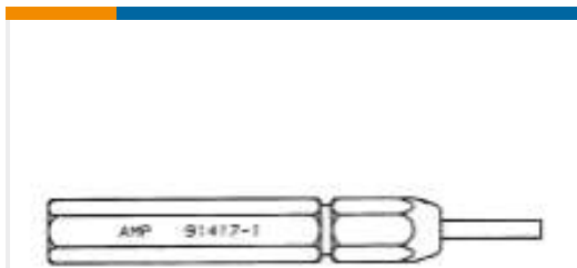
TE Part # 91417-1 TOOL, KEYING (AMPMODU MTE)