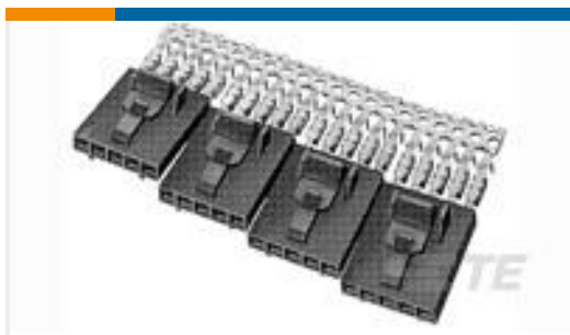
TE Part # 103958-1 10X2 MTE RPT SR LATCH .100CL