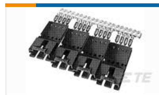
TE Part #5-103945-3 4X4 MTE SHRD PIN SR LATCH .100