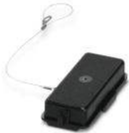
HEAVYCON protective covers, B16, for HC-EVO-B16... supporting base element, for single locking latch, with retaining cord with combination eyelet, IP54

Please be informed that the data shown in this PDF Document is generated from our Online Catalog. Please find the complete data in the user's documentation. Our General Terms of Use for Downloads are valid ( http://phoenixcontact.com/download )