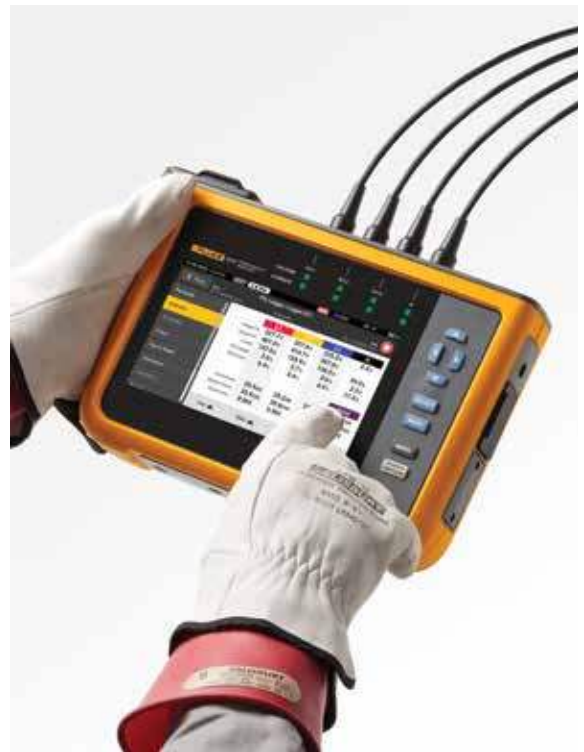
Easily navigate using the large color touchscreen

When downloading data from the Fluke 1770 Series Power Quality Analyzers the included Energy Analyze Plus software package can compare measured voltage and current harmonic statistical data to different standards, like EN 50160 or IEEE 519, to determine if they exceed compliance limits. This powerful predictive maintenance feature enables current harmonics to be observed before distortion appears in the voltage allowing you to prevent unexpected failures or non-compliance situations and increase system uptime. With the proliferation of inverter-based loads and power generation, keeping current harmonics in check is becoming increasingly critical to ensure reliable power quality and avoid system downtime.