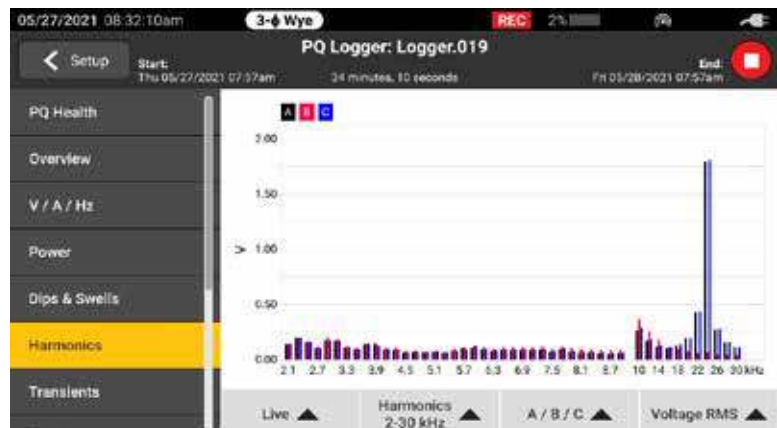
A full range of harmonics are available from the first 50 integer harmonics and from 2 kHz to 30 kHz

The Fluke 1770 Series was designed to be safe and easy to use in any measurement environment. The 1770 Series allows you to capture a full range of power quality variables as well as high-speed waveforms, high-speed transients, and higher frequency harmonics, all of which are instantly viewable on the large, high-resolution screen. With a best-in-class CAT IV 600 V / CAT III 1000 V overvoltage rating, these analyzers can be used at the service entrance or downstream, measuring AC and DC inputs, and harmonics measuring up to 30 kHz. With the 1770 Series you can be confident that you'll capture the data you need to make better maintenance decisions no matter the task.