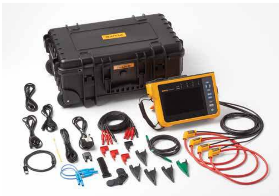
Fluke 1777 Power Quality Analyzer. Note: Included items vary by model and are listed in the “Ordering information” table.