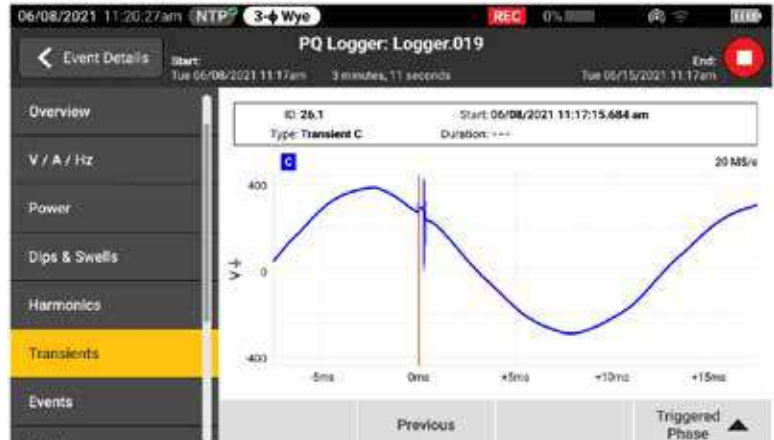
View real-time voltage transitory events while logging for faster troubleshooting

Transients negatively impact otherwise healthy systems every day and their potential to damage your equipment can't be underestimated. Whether your system is experiencing impulsive or oscillatory transients, the results can be devastating and cause problems ranging from insulation failures to total equipment failures. The Fluke 1775 and Fluke 1777 incorporate advanced transient capture technology to help you clearly identify high-speed voltage transients, so you have the data you need to stop them in their tracks. The Fluke 1775 Power Quality Analyzer has 1MHz sampling capability to capture fast transients, while the Fluke 1777 Power Quality Analyzer has 20MHz sampling capability to capture the fastest transients in high detail.