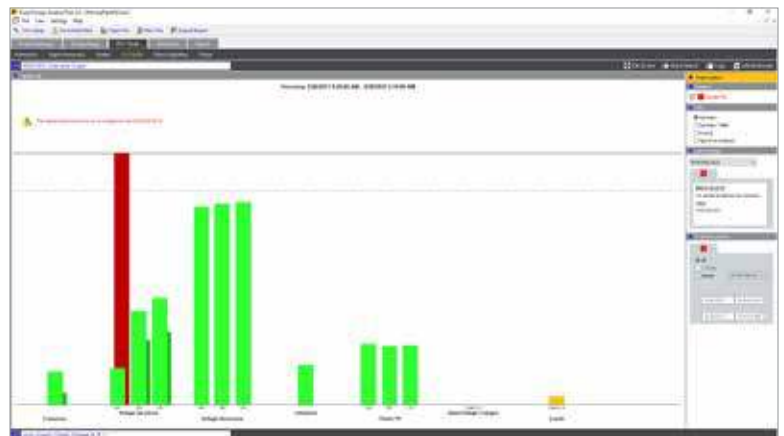
Fluke Energy Analyze Plus: Power quality health summary