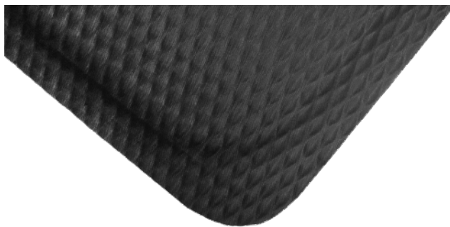
Hog Heaven with black border

Can be customized with your logo, design, or message (see Hog Heaven Impressions)