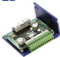
Single Axis Driver R325P