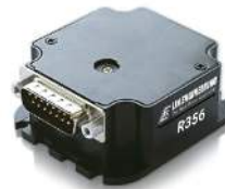
Single Axis Controller+Driver R356