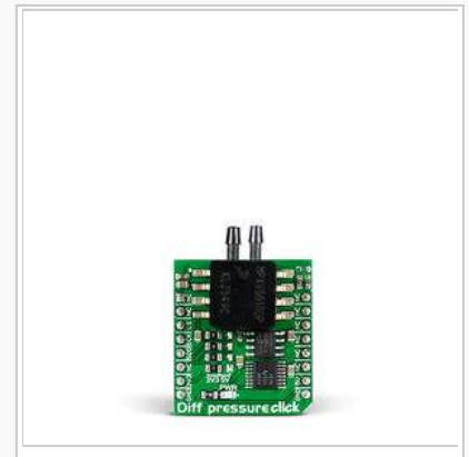
Diff pressure click