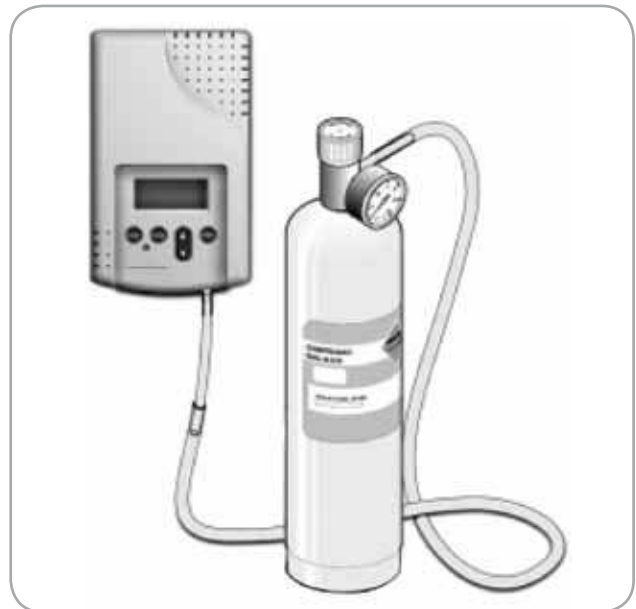
The illustration shows the complete set-up for calibrating a sensor with display.