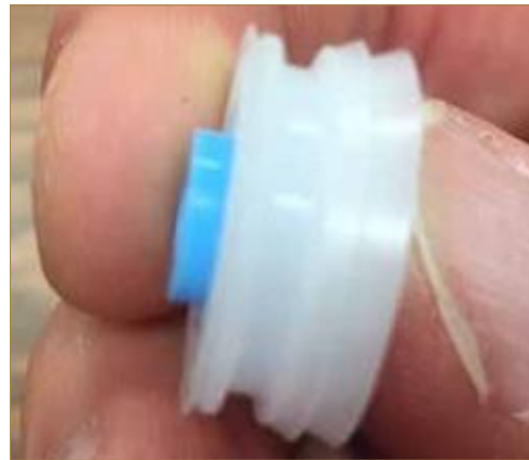
BETTER CHEMICAL COMPATIBILITY