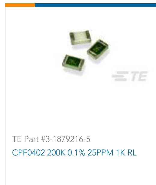
TE Part #3-1879216-5 CPF0402 200K 0.1% 25PPM 1K RL