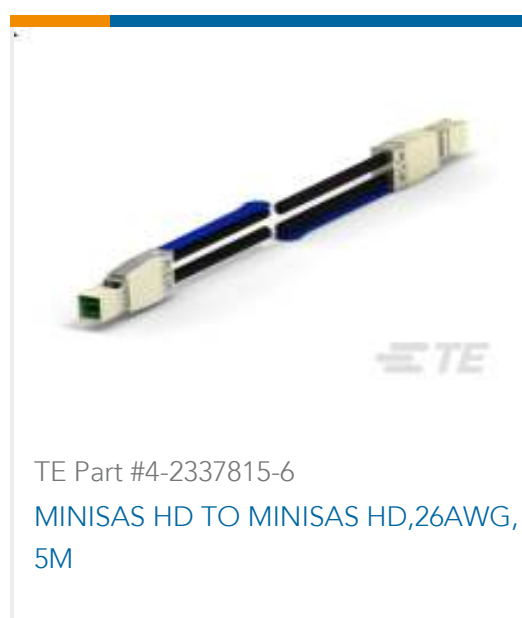
TE Part #4-2337815-6 MINISAS HD TO MINISAS HD,26AWG, 5M