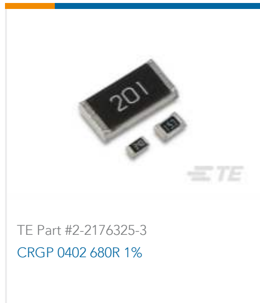
TE Part #2-2176325-3 CRGP 0402 680R 1%