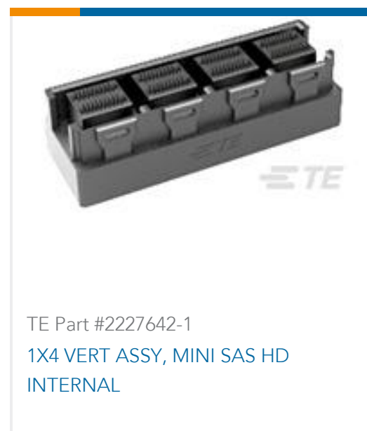
TE Part #2227642-1 1X4 VERT ASSY, MINI SAS HD INTERNAL