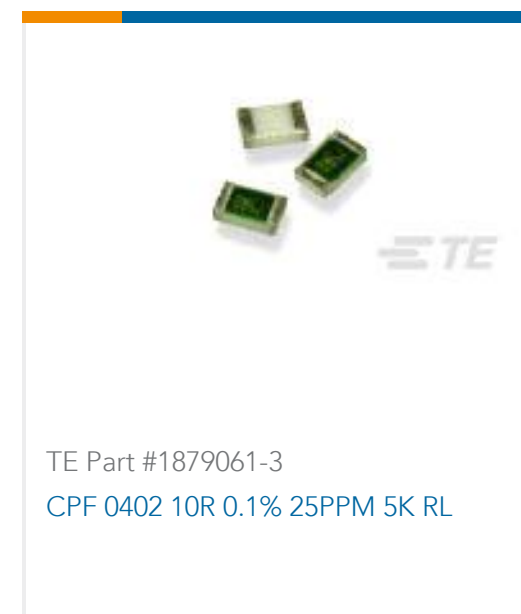
TE Part #1879061-3 CPF 0402 10R 0.1% 25PPM 5K RL