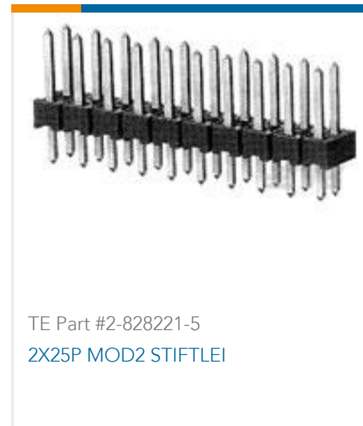
TE Part #2-828221-5 2X25P MOD2 STIFTLEI