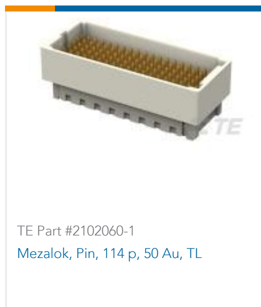
TE Part #2102060-1 Mezalok, Pin, 114 p, 50 Au, TL