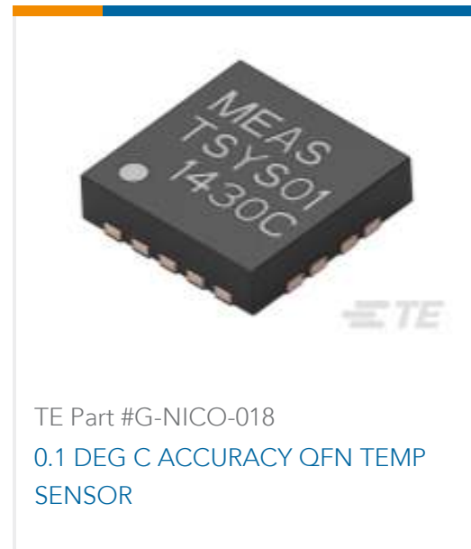
TE Part #G-NICO-018 0.1 DEG C ACCURACY QFN TEMP SENSOR