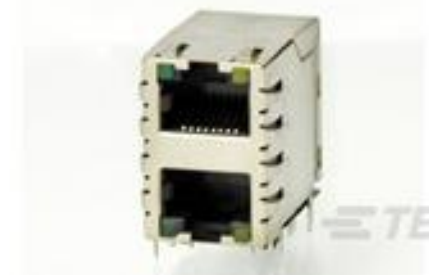
TE Part #1-6368011-1 STK JK,2X1,SHLD,G/Y BI-CLR LED