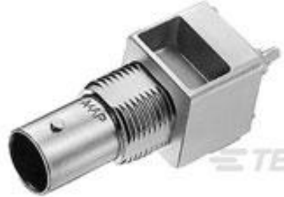
TE Part #5227673-1 BNC PCB VERTICAL JACK W/POST