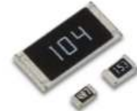
TE Part #4-2176339-3 CRGCQ 0603 33K 1%