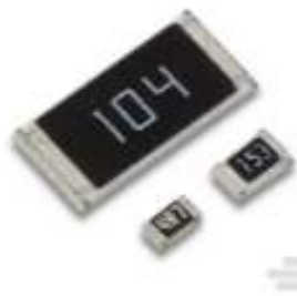
TE Part #2-2176339-1 CRGCQ 0603 470R 1%