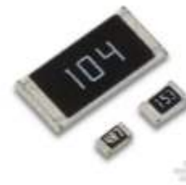
TE Part #1-2176341-7 CRGCQ 0805 220R 1%