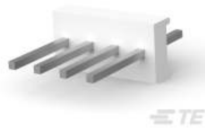
TE Part #640456-2 PCB Header: Polyester, Vertical, Unshrouded, No Mating Alignment