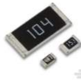
TE Part #4-2176339-5 CRGCQ 0603 47K 1%